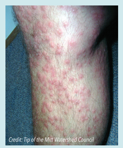
Each reddened area is a point of cercarial entry and does not spread or develop into water blisters.

Symptoms include intermittent periods of itching that will continue for several days. Many suffering from swimmer's itch experience the most severe itching early in the morning. Usually the reddened areas reach their largest size after approximately 24 hours. The itchy, reddened, and raised areas are sometimes confused with bites from chiggers or mosquitoes and the symptoms may be misdiagnosed as those resulting from poison ivy or stinging nettles. Chigger bites are usually located at points where clothing contacts the skin such as wrists, waist, ankles, etc. For swimmer's itch, itching is limited to points of cercarial entry and will not spread or develop into water blisters.