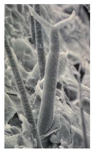
Avian schistosome cercaria penetrating human skin.